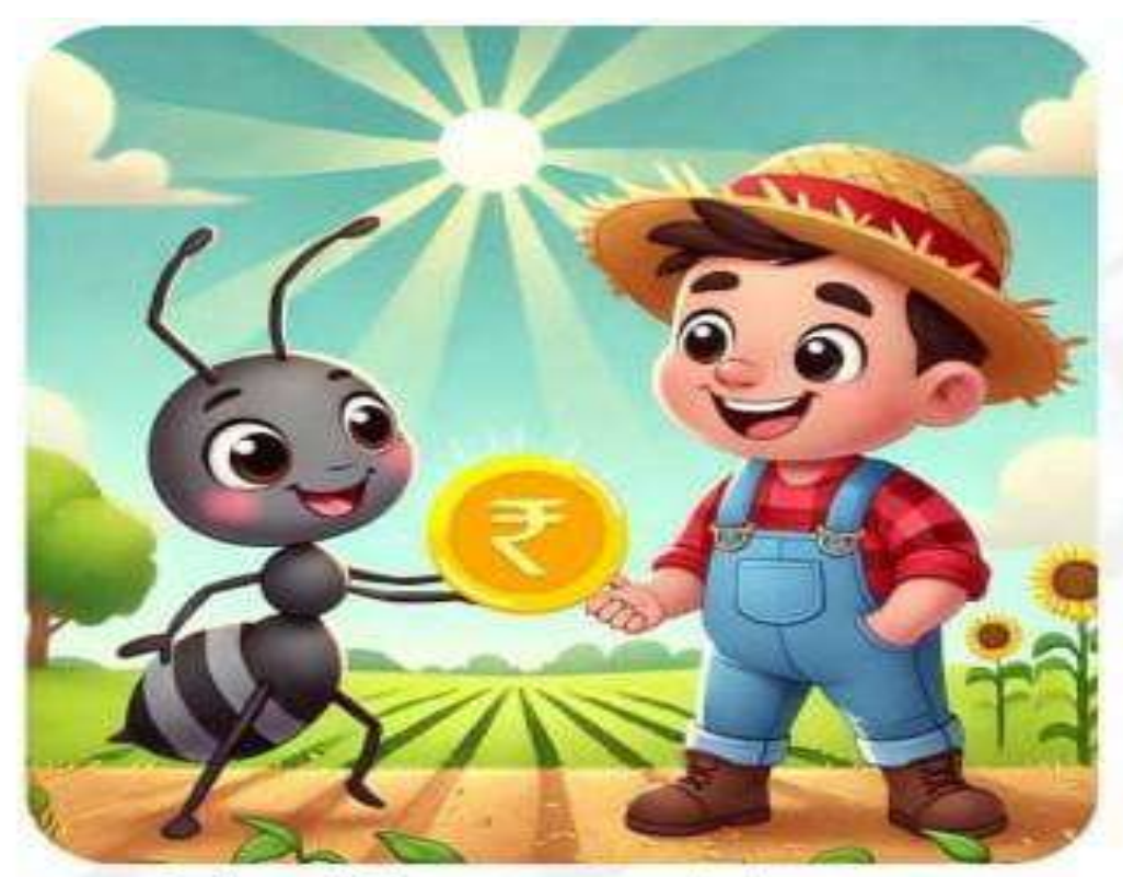
The Honest Ant

One day, an ant found a shiny coin. It couldn't use it, so it gave it to the farmer who dropped it. The farmer smiled and said, "Thank you for your honesty!" The ant felt happy because doing the right thing is always good.